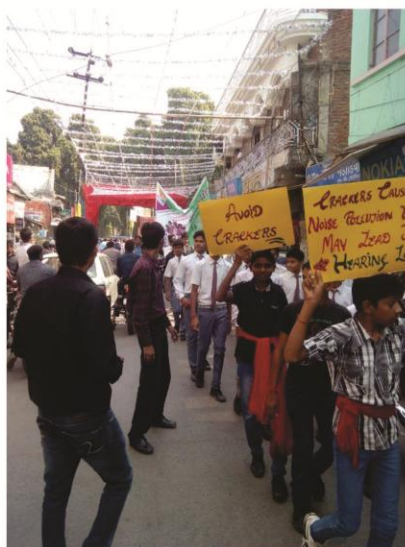
Anti-cracker Campaing organised by VGS Students!