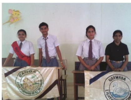
Inter House Debate Competition

In order to realize the highest ideal of education and inculcate a healthy competition, the school has been divided into the four Houses. Inter House competitions are organized regularly to nurture the overall growth of the child.